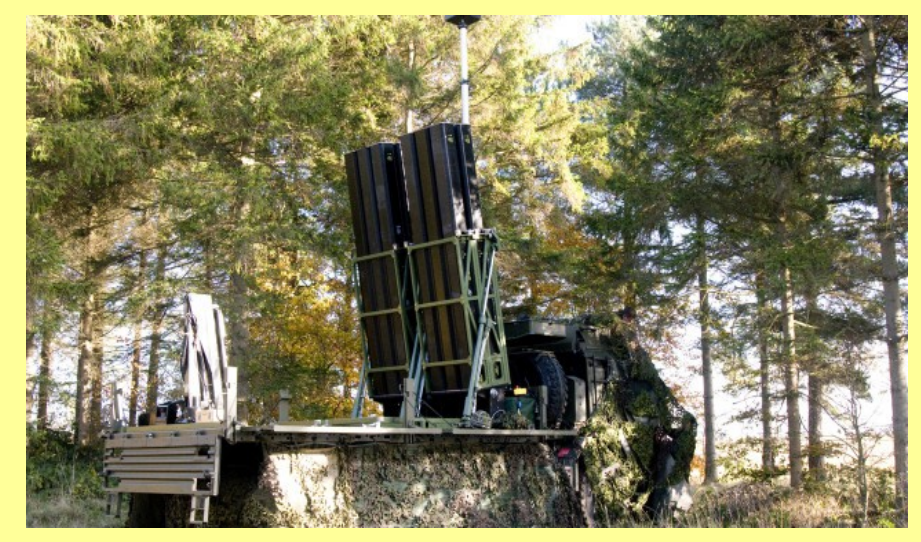
Missile Defence System

OSBORNE : To bankrupt UK economy with unsupported debt after Land Registry sale.